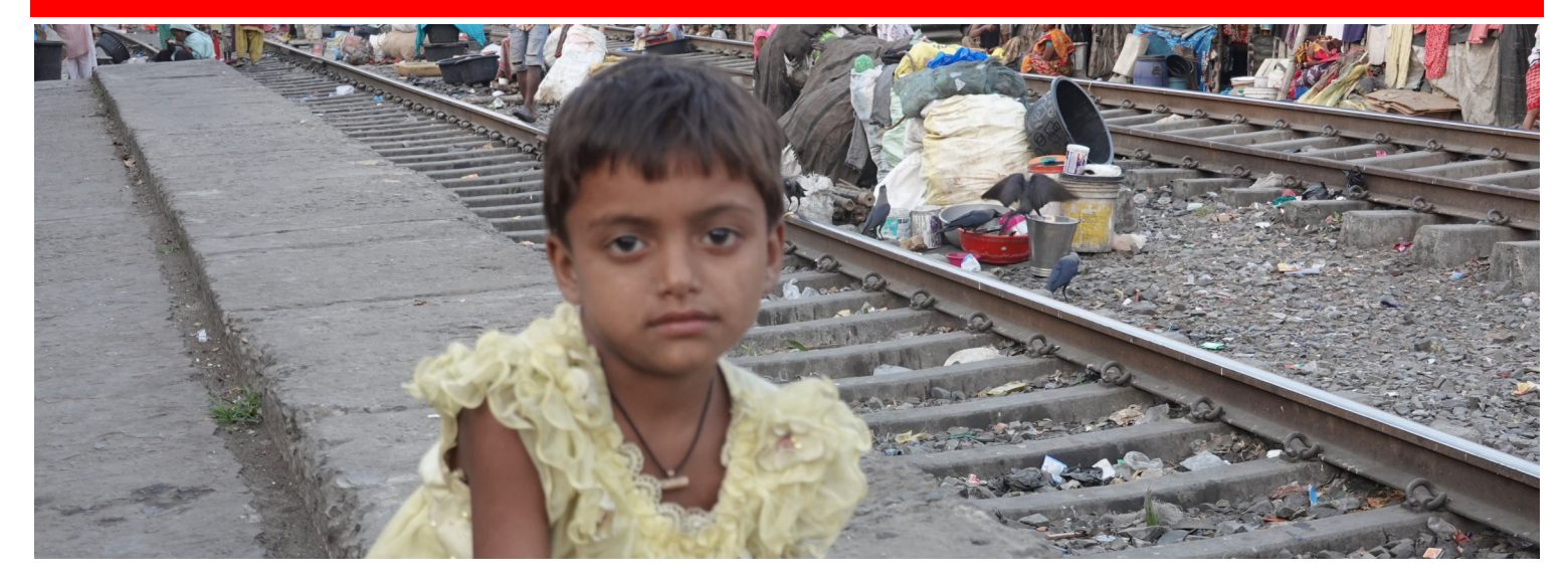
In India, it would take 7 generations for a member of a poor family to achieve average income*

Why is it so hard for a person in poverty to change their future? With education now free in India, why are more than 3 million primary school age children out of school? Why does poverty persist for so many that do attend school?